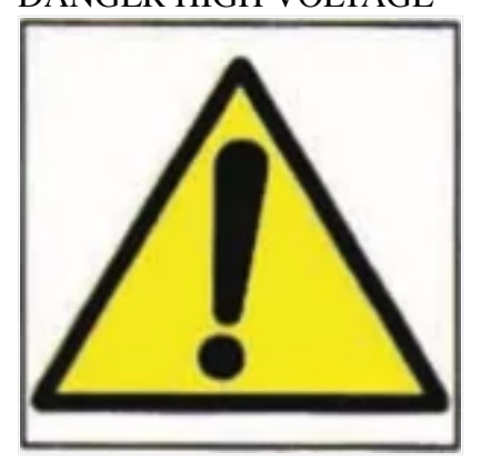
DANGER OF ACCIDENT