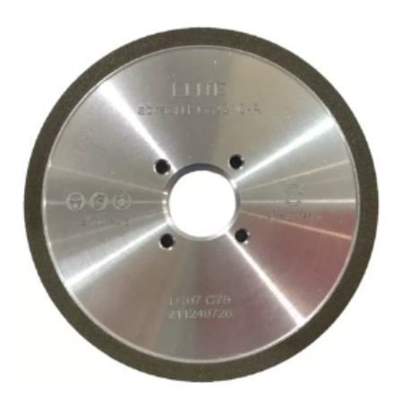
Flank grinding wheel

For the grinding wheel use the ref. nr. 2310-A. 1A1 D107 C75 ø100x4x5x10xø20 mm.