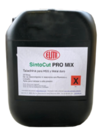
SintoCut PRO MIX 20 L

We recommend to use ELITE SintoCut PRO MIX or equivalent to mix with water emulsion. If you prefer to grind with oil, you can use our SintoCut PRO MD. Both coolant are available in 20 liters can or 200 liters barrel.