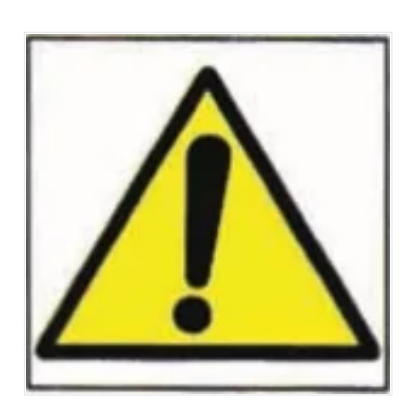
DANGER OF ACCIDENT