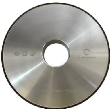
CBN grinding wheel

We recommend using ELITE ref. nr. B20-6. CBN grinding wheel \varnothing 125x20x20 mm.