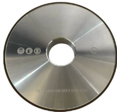
Diamond grinding wheel

We recommend using ELITE ref. nr. B20-5. Diamond grinding wheel \varnothing 125x20x20 mm