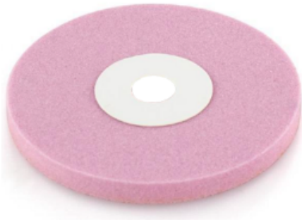
Corundum grinding wheel

We recommend using ELITE ref. nr. B20-4. Corundum \varnothing 125x20x20 mm