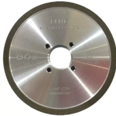
Flank grinding wheel

For the grinding wheel use the ref. nr. 2310-A. 1A1 D107 C75 \phi 100x4x5x10x \phi 20 mm.