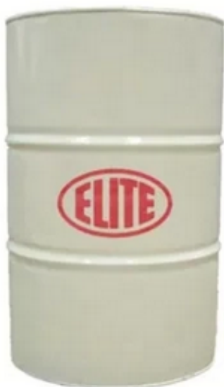
SintoCut PRO MIX 200 L