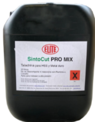
SintoCut PRO MIX 20 L

We recommend to use ELITE SintoCut PRO MIX or equivalent to mix with water emulsion. If you prefer to grind with oil, you can use our SintoCut PRO MD. Both coolant are available in 20 liters can or 200 liters barrel.