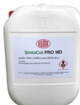
SintoCut PRO MD 20 L